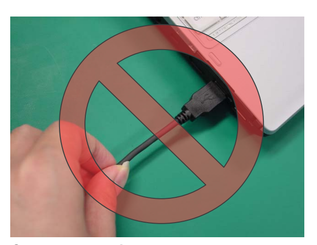
Connect and disconnect properly