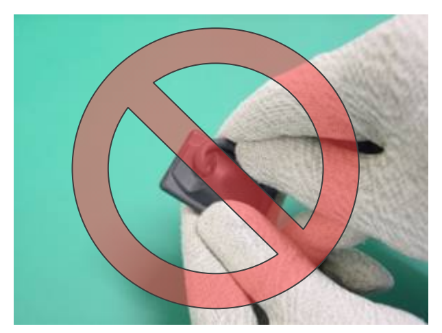
Do not bend the cable hard