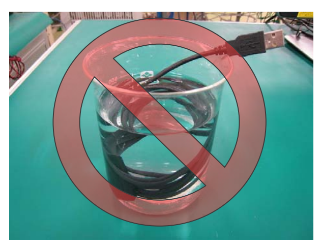
Do not immerse the cable in any liquid

Please refer to our website for details.