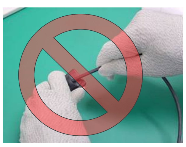
Do not pull the cable