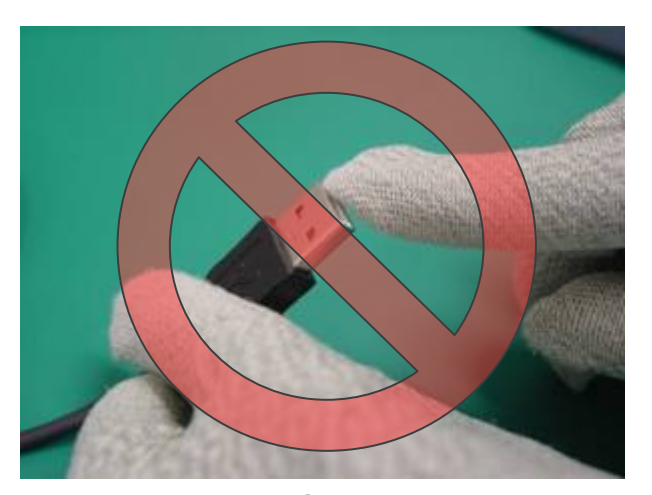
Do not touch the pins